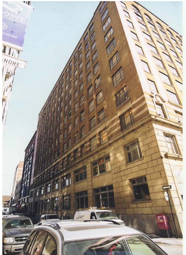
Figure 1: The building prior to renovation

The restoration work included major repairs and retrofit to the building envelope, including the exterior masonry, replacement of the existing windows as well as replacement of all the existing roofing systems.