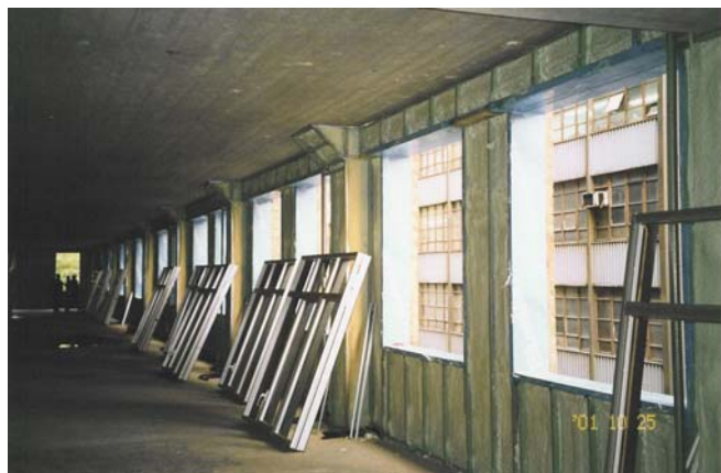
Figure 8: Window frames prepared for installation

Particular care was taken to ensure continuity of the air-barrier assembly at the wall-window interface. A wood sub-frame was assembled around the window rough openings and covered with a self-adhesive bituminous membrane. The wood sub-frames were installed prior to application of the polyurethane foam insulation in order to ensure continuity of the air barrier assembly and insulation between the wall and window sub-frame interface.