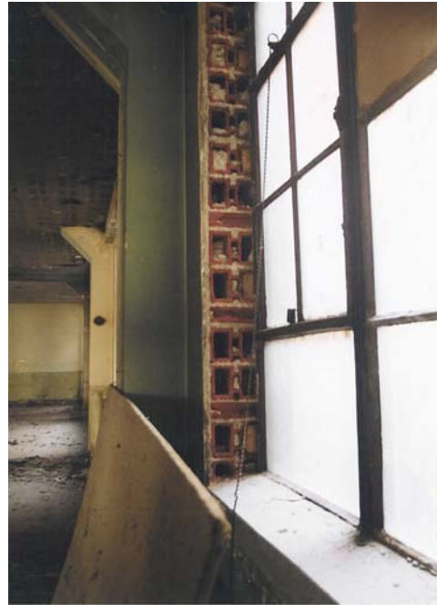
Figure 3: Original wall composition

To minimize the risks related to increasing the thermal resistance of the exterior walls from the inside, a two-part strategy was developed which involved corrective work to both the interior and exterior surfaces of the exterior walls.