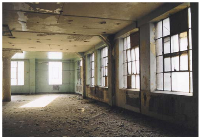
Figure 2: Interior view prior to renovations