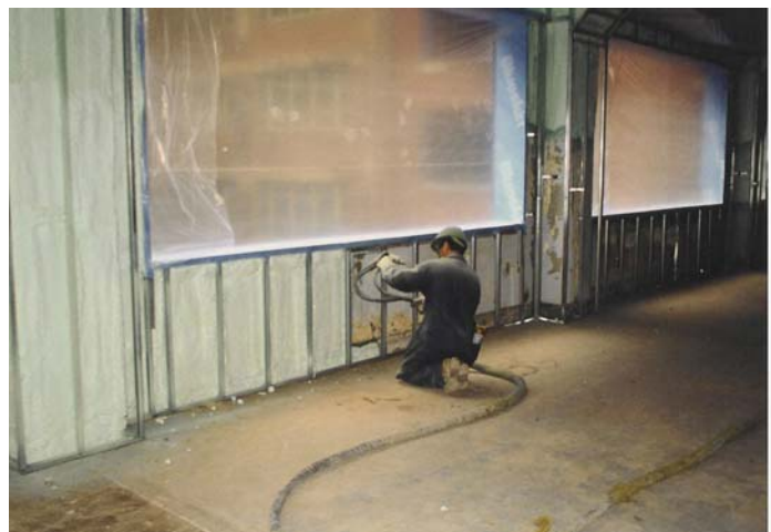
Figure 4: Application of polyurethane foam insulation

The original and renovated wall compositions are illustrated in the figures below, with a table summarizing hygrothermal analysis results for the original wall composition as well as the renovated wall composition, with and without the addition of a vapour barrier.